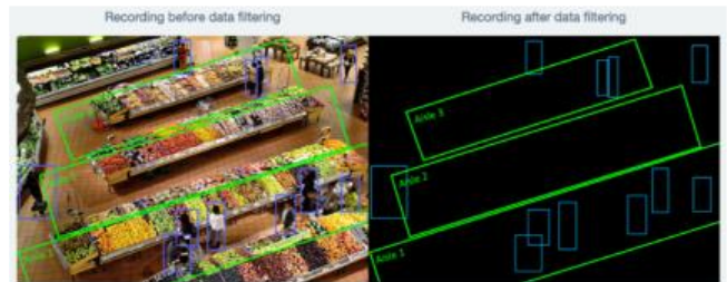
Figure 2: Surveillance footage without anonymization (left) and with vectorized streaming based anonymization (right)

These modes give our customers the flexibility to decide how to handle data storage and processing.