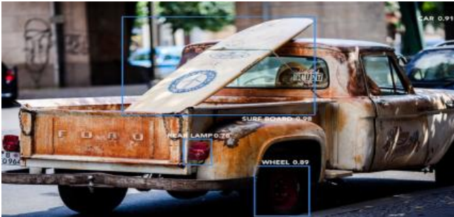
Figure 1: RAYPACK Multi-Object Detection at work.

RAYPACK Multi-Object Detection is deployable as a service on our RAYPACK.AI platform or can be conveniently embedded into existing systems on-premise. Like all our models it is easy to use for AI novices, while still offering flexibility to AI experts. We provide businesses with the capabilities to use the enormous potential of AI models, without creating AI dependencies.